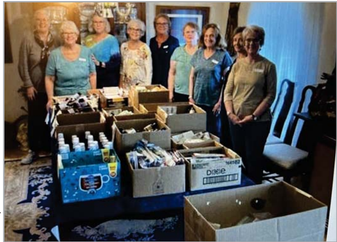
need for a domestic violence shelter that would provide an environment that was culturally and linguistically appropriate for monolingual Spanish speaking survivors and their children. The shelter, located in South Central Phoenix, provides an average of 500-600 clients a safe and secure environment where they can recover from the devastating effects of abuse as they acquire the knowledge and skills necessary to become self-sufficient and break the cycle of violence.

Are you disappointed that the activity group you were interested in is closed?